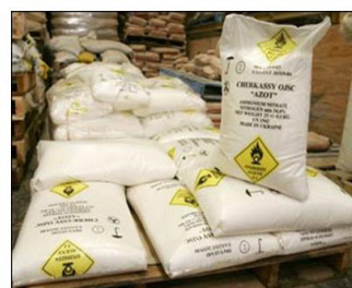
Ammonium Nitrate Fertilizers