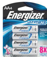
Lithium Batteries (Lithium Strips)