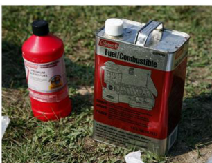
Camping Fuel, Zippo or Ronseal Lighter Fluid, & Charcoal Lighter Fluid