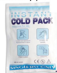
Instant Cold Ice Packs